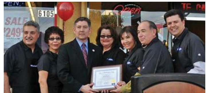
Huntington Park City Council and City Manager welcome the city’s newest business