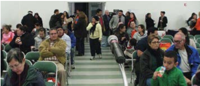
Residents gather for Huntington Park town hall meeting at Lucille Roybal-Allard Elementary School.